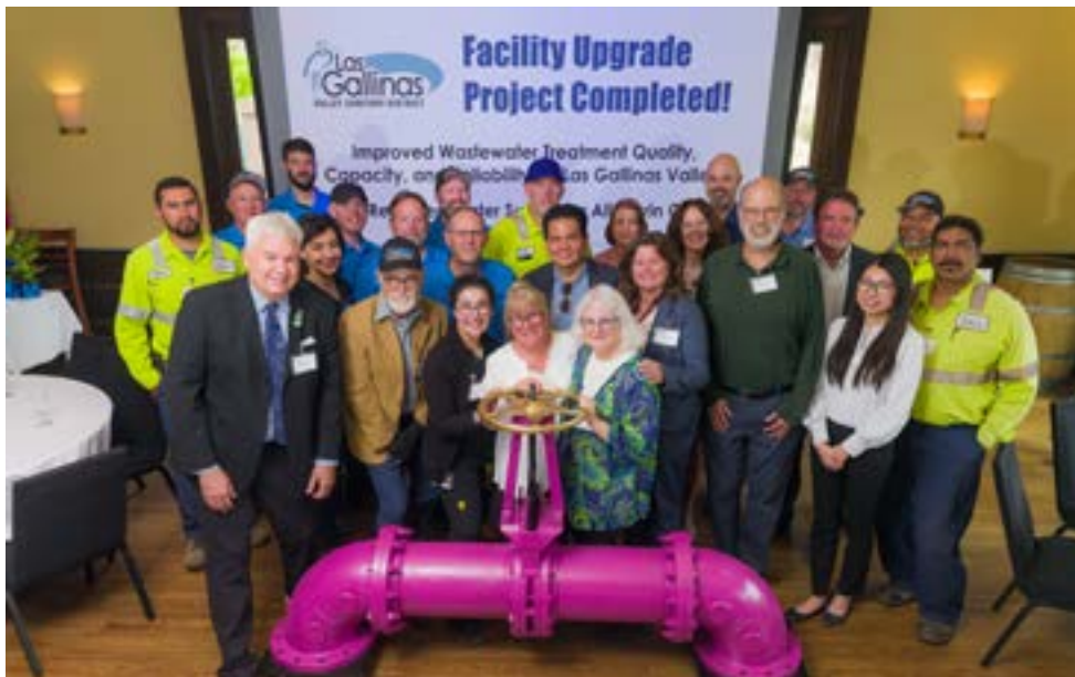
Las Gallinas Valley Sanitation District staff and board members celebrate the completion of the major plant upgrade project.